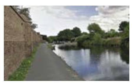
volunteering and workshop programme on the Canal & River Trust's website at bit.ly/46bV1Br

You can find out more about the community wellbeing activities,