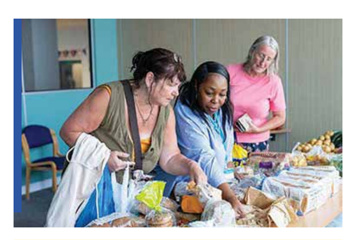
Find out more

You don't need vouchers; just drop in between 10am-1pm.